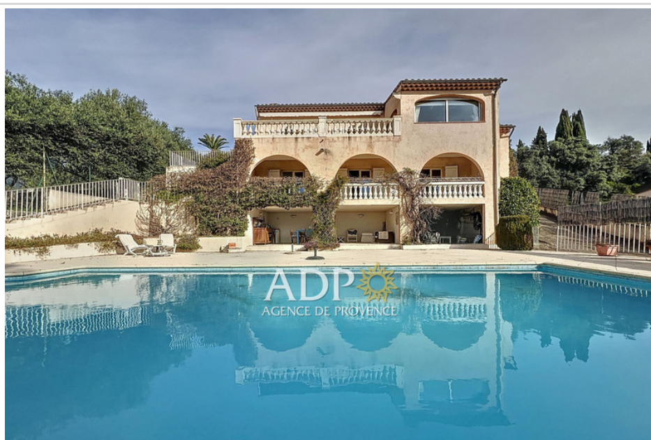
House 729 Grasse

Fees paid by the owner, no current procedure, information on the risks to which this property is exposed is available on georisques.gouv.fr